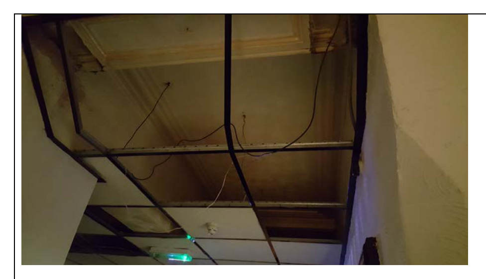
Ceiling tiles in the main reception hall, unsightly condition rather than dangerous.