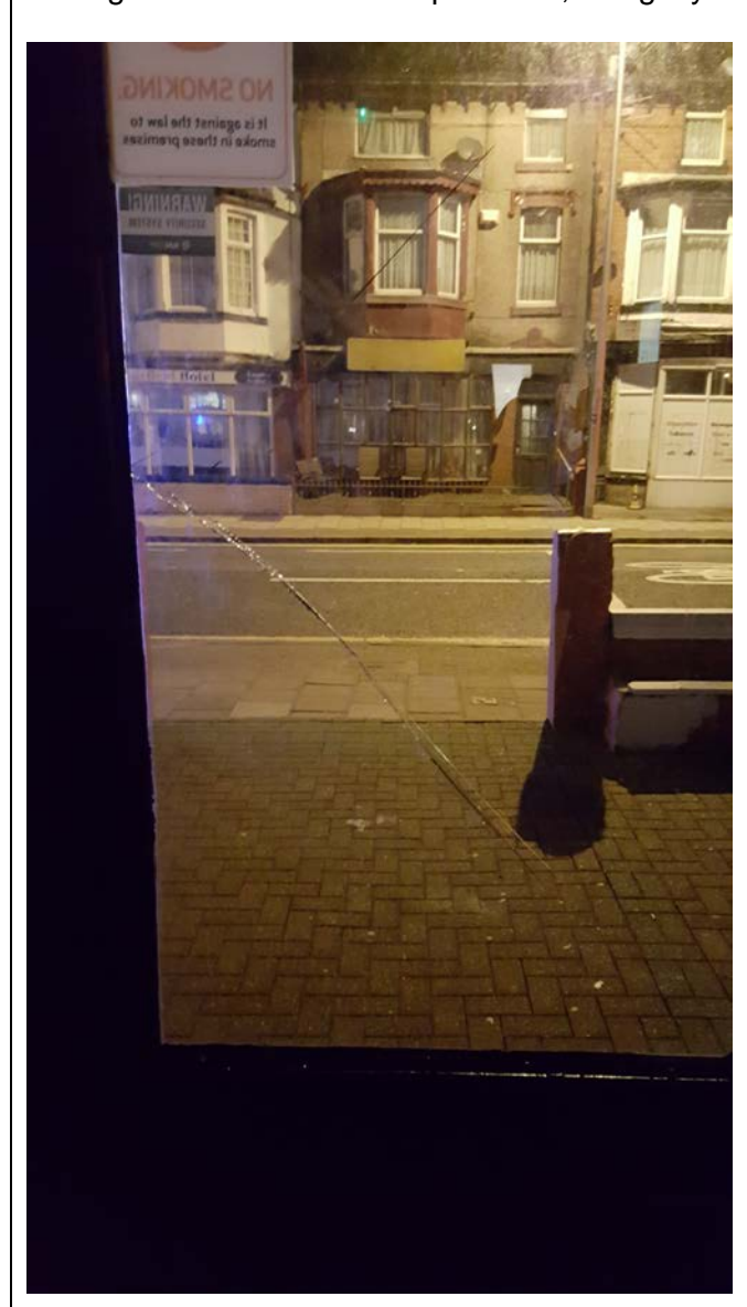
Large crack in the glass to the main front, further evidence of disrepair.